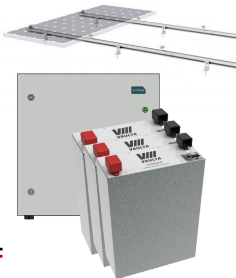
K34.150.03 + 3 x 5KWh