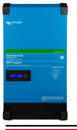
Easysolar48/5000 x 1