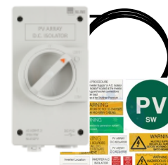
Isolator + Extras